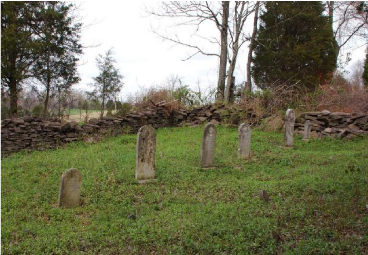
Looking west – left to right: Nos. 31, 33, 35, 36, 38, 40