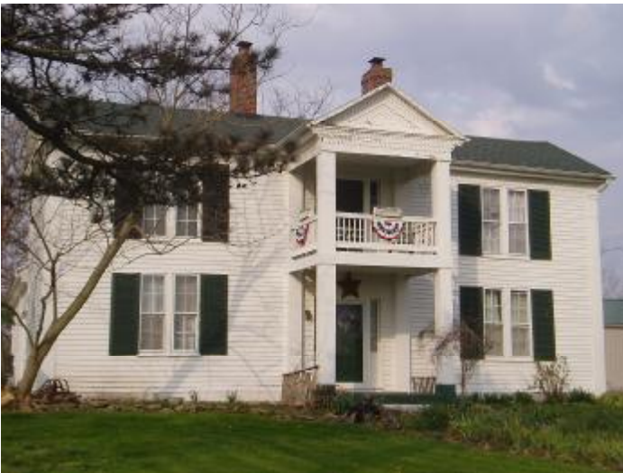
R.H. Crossfield house, 2007

From the Crossfield Family Cemetery , head south (gate is on the south side) down the hill, cross the creek (which is one of the branches of Fox Creek), climb up the hill on the other side and when you come out of the trees the house will be visible to your left.