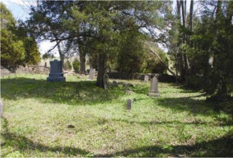
Crossfield Family Cemetery Looking east

View from Anderson City Rd. looking south. There is a little pond just below and to the right of the trees in the middle of the field behind the tractor. Notice the fence line running along beside the tractor. The cemetery is located where the fence line intersects the line of trees (middle of picture) on the edge of the field.